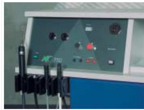
Main control panel featuring four instrumentholders. (three of them switchable)